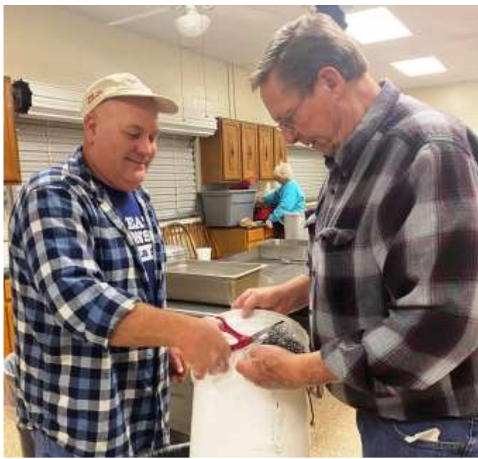
Thanks! The turn-out of volunteers to help was exceptional!