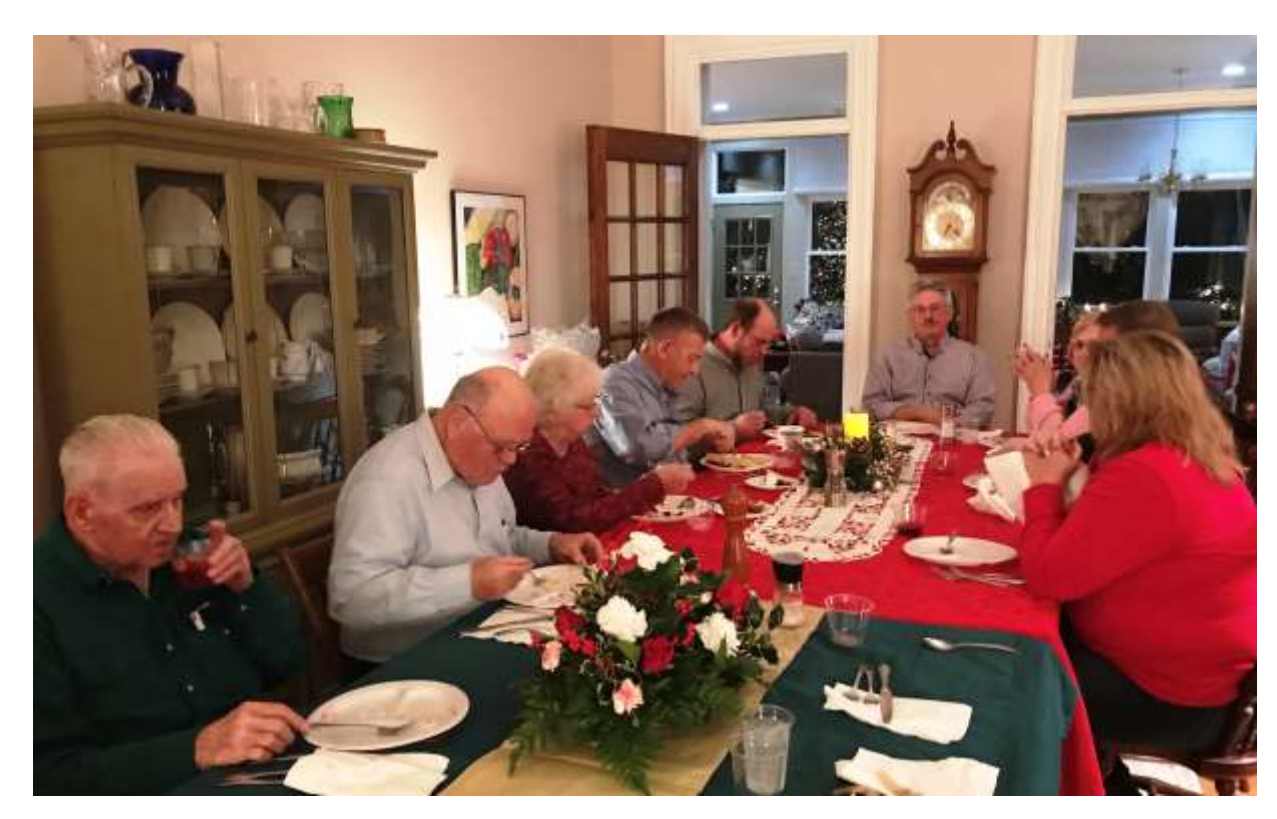
Perry Valley Grange members and friends enjoyed a holiday potluck dinner and evening of fellowship together in December.